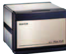
HC-6 (SUS) Stainless steel