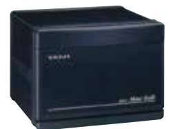
HC-6 (K) Black