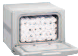
HC-6 (W) White