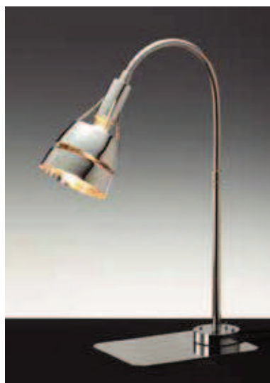
Base plate type