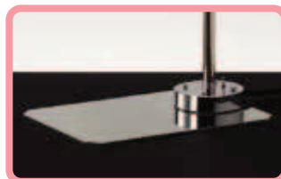
Base plate size W257 x D366