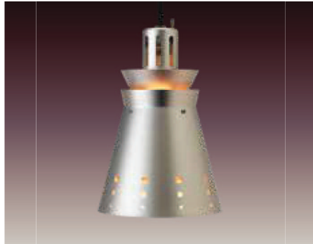
(S) stainless steel