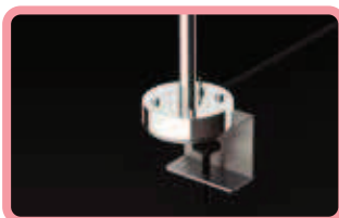
Clamp size W116 x D133