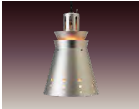
(S) stainless steel