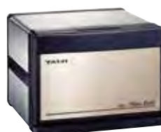
HC-6 (SUS) Stainless steel