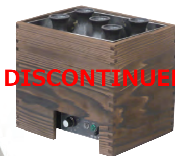
Wooden frame (Option)