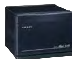
HC-6 (K) Black