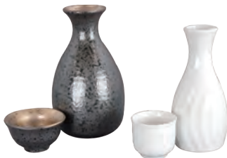
Serving bottle (black) 320cc / (white) 150cc Available on the demand