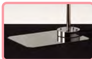
Base plate size W257 x D366