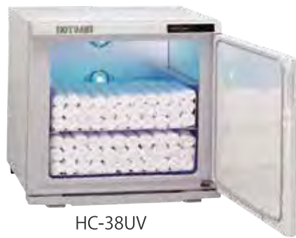
Sterilizing UV lamp