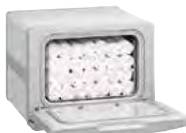
HC-6 (W) White