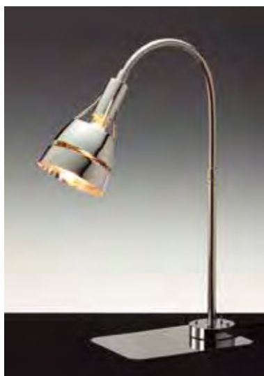
Base plate type